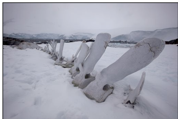
At Port Lockroy, we found not only the museum in the old station, but also this season's first Gentoo chicks and a composite skeleton of a large baleen whale at Jougla Point.