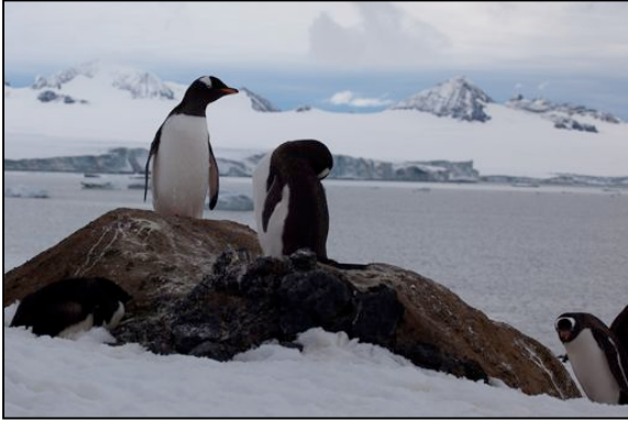
Antarctic welcome at Brown Bluff.

proper as the Tabarin Peninsula represents the most easterly part of the Antarctic Peninsula. The striking 745-meter (2,225 ft) tall bluff is the remnant of a subglacial volcano whose eruptions issued string lava first then blasted ash and rock during the Early Pleistocene. Today, the reddish-brown hues of the cliffs and scree slopes offer a