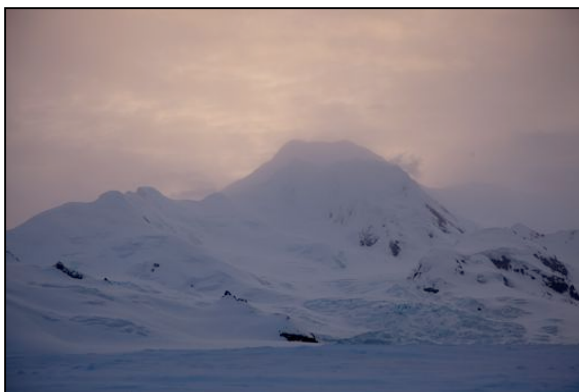
Evening light on Livingston Island.