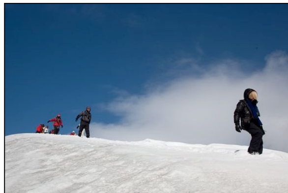
Exploring Telefon Bay, Deception Island.

A short zodiac ride got us to shore near a small 162 m high cinder cone, the focal point of our morning trek. While the great majority took on the ridge hike to the summit or at least a part of it, the more contemplative among us explored the tide line. The antics of cavorting penguins and the odd seal that would swing by occasionally for a curious look at the visitors didn't allow for any boredom. Had it not been for growling stomachs, we would have stayed on as the winds had all but died down and the views were stunning across Telefon Bay and Port Foster. However, our expedition schedule promised more adventure across the Bransfield Strait, the body of water that divides the South Shetland Islands from the Antarctic Peninsula.