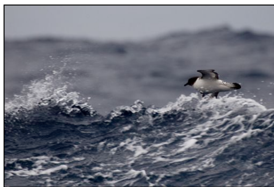
A Cape Petrel enjoying, the stormy seas more than we did.