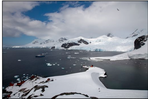
Impressions from Skontorp Cove and Almirante Brown Station, Paradise Bay.

group photograph most of us were off for the summit hike and enjoyed a lovely view from up top. The descent was likely the most enjoyable part of the outing for some as it offered a long-awaited opportunity for sliding back down to the station.