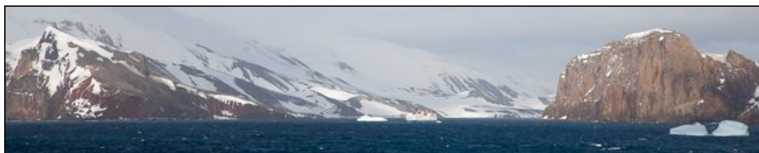
Entering the caldera of Deception Island through Neptune's Bellows.

We woke to sunny skies for a change and already had our morning destination, Deception Island - a dormant volcano - off to our starboard. As we finished breakfast, Captain Parfenyuk sailed the Professor Molchanov into the caldera of Deception Island, passing the treacherous chasm of so-called Neptune's Bellows. This narrow isthmus with a perilous sub-surface rock stuck in the middle, is the only break in the island's caldera wall allowing access to Port Foster. Despite the strong winds that blow through the 'bellows', the crater is one of the safest natural harbours in the South Shetlands. It has been a sought-after anchorage since 1820, when sealers thoroughly explored the region and a young sailor, Nathaniel Palmer, spotted hitherto unfamiliar land farther to the southwest. What Palmer sighted would later turn out to be the Antarctic Peninsula. Unbeknownst to him at the time, however, a scientist and explorer sailing for the Russian Czar had made a similar observation a few months earlier from a location further north. The name of that person had been Thaddeus von Bellingshausen, after whom the Soviet Union named their new research base on King George Island 141 years later, which we had visited the day before.