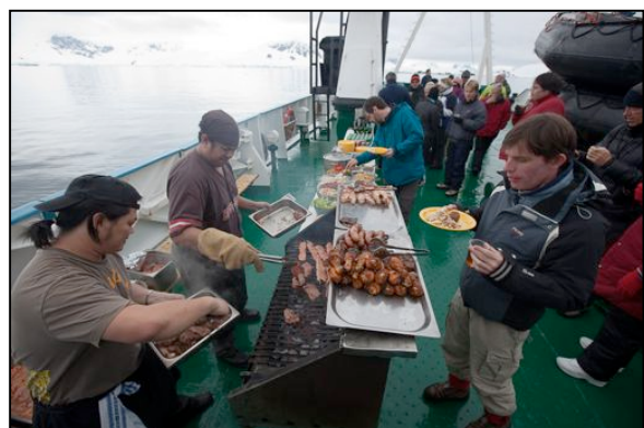
Passage through Wilhelmina Bay.

The Professor Molchanov was beautifully parked, as we cruised with the Zodiacs, watched by a suspicious tern, while the chefs prepared an Antarctic BBQ for us!