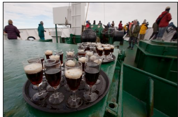
Cruising the Antarctic Sound – refuelling