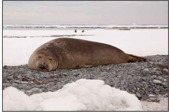
Blind passenger en route to Yankee Harbor. Lazy Elephant seal on the beach of Greenwich Island.

exactly work up the town folk a couple of sleepy juvenile elephant seals nearby. Life around the research stations made a rather lethargic impression on us.