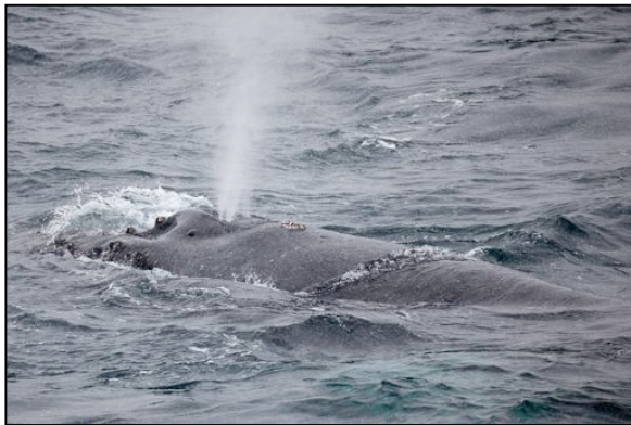
Curious Humpback whale, Dallmann Bay.