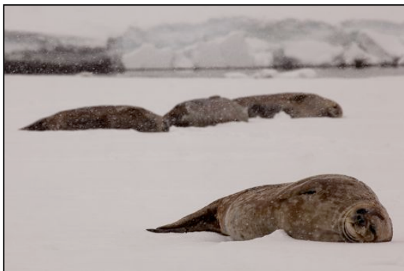
Friendly Weddell Seal and cold, but happy visitors, Melchior Islands.