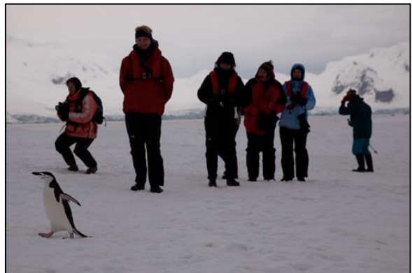
Chinstrap penguin stealing a pebble and the show at Half Moon Island.