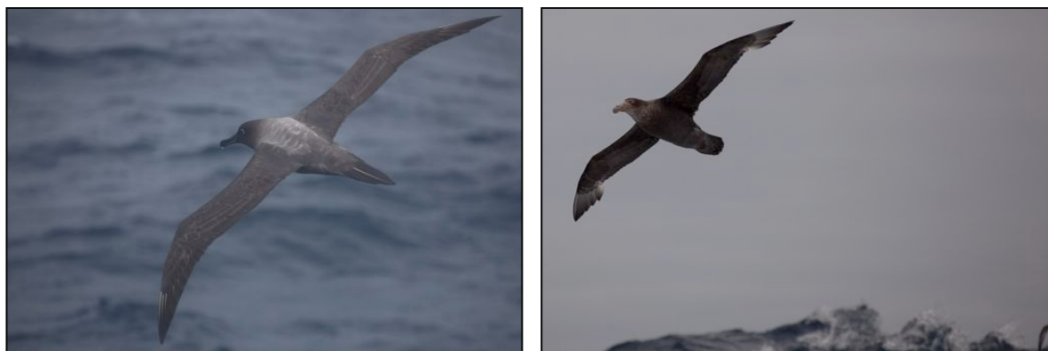
Light-mantled Sooty Albatross and Southern Giant Petrels accompanied us across the Drake Passage.

With only a few passengers daring to stay up on two legs and moving around the ship, the intended lecture program was postponed to the next day. Instead, a couple of film documentaries on Antarctic exploration at the turn of the 19 th century were offered to provide at least some distraction in the afternoon. Much to our surprise, the seas started calming after our first dinner at high sea affording better sleep to most.