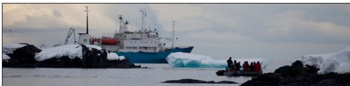
Professor Molchanov anchored near Foyen Harbor, Enterprise Island.

A couple of hours of zodiac cruising during cold conditions greatly improve one's appetite, regardless of just having had a three-course lunch a few hours prior. Little did we know that during our absence the galley team and Russian crew had prepared an outdoor BBQ on the aft decks of the Professor Molchanov . The whiff of BBQ'd meats and fish dishes greeted us from far away and the zodiac drivers didn't waste much time getting us back onboard. There, an enormous spread of salads, side dishes, meats and fish invited us to feast. Drinks were on the house and soon after deserts had been enjoyed, the deck served as a dance floor. A good time was had and the party did not end until after midnight – we were tired although it was still light outside.