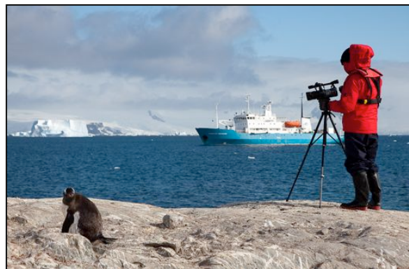
Enjoying scenery and wildlife at Mikkelsen Harbor, Trinity Island.