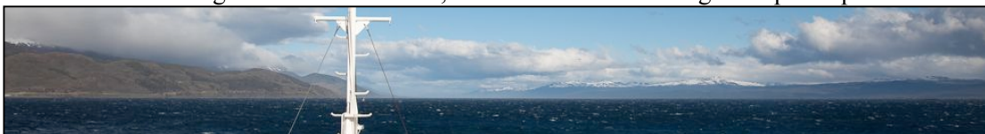
The Beagle Channel

Most of us had spent at least one day in Ushuaia, where 'Antarctica' naturally tends to be the talk of town among travellers. In turn, the excitement among the participants of our