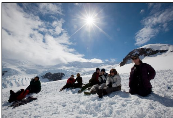
The spectacular scenery of Andvord Bay surrounded us, as we enjoyed a morning at Neko Harbor.